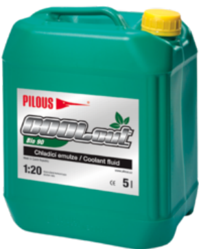
COOLcut Bio 90

In addition to use in saw bands the product is designed for machining operations carried out both on conventional machines and NC and CNC machining centres. Recommended concentration 4–7 %. 5 litres pack. Dilution 1:20.